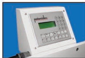
Easy to Read Control Panel