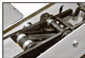
Simple Tape Drive